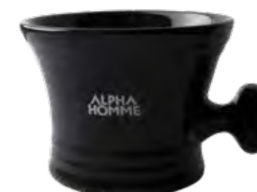
SHAVING BOWL ESTEL ALPHA HOMME

Soft natural badger bristle is durable and long-lasting and provides massaging effect. Handle is made of black resin and is thoroughly polished for better tactile properties what makes the use of the tool extremely comfortable. Handle diameter: 33 mm.