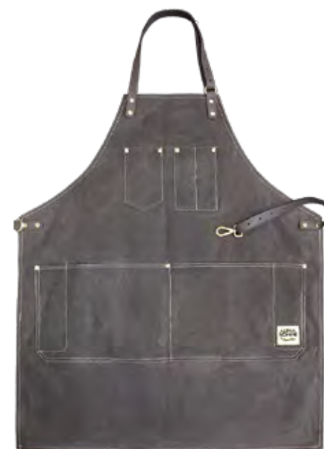
BARBER APRON ESTEL ALPHA HOMME