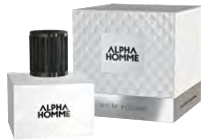
EAU DE PARFUM ESTEL ALPHA HOMME WHITE EDITION pour homme