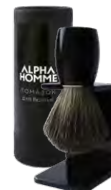
SHAVING BRUSH ESTEL ALPHA HOMME

Professional barber apron is made of heavy waxed cotton. Thanks to a wax cover, small hair cannot pass through the fabric. Adjustable straps on the neck and waist are made of genuine leather. Comfortable pockets: upper ones are designed for scissors and blade razors, lower ones - for clippers and brushes.