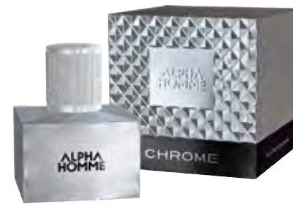
EAU DE PARFUM ESTEL ALPHA HOMME CHROME pour homme