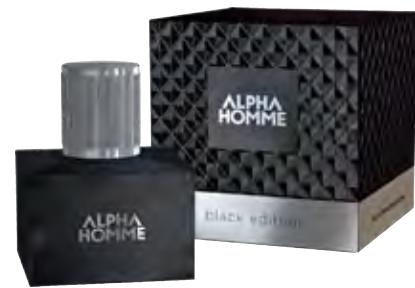
EAU DE PARFUM ESTEL ALPHA HOMME BLACK EDITION pour homme

Your fragrance is a personal signature to actions and decisions. It is a symbol of someone who takes matters into his own hands.